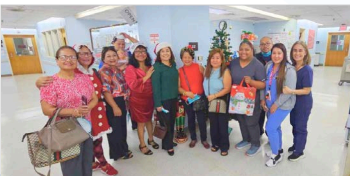
Guam Galaide Lions Club Spreads Joy with their Toy Donation to our Pediatric Department