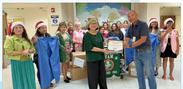
Filipino Ladies Association of Guam, donation of adult size hospital gowns