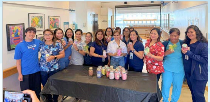
KUAM and Tiyan High School, Bottles of Hope to our SNF nurses on Giving Tuesday