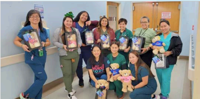
Love Bears from GTA Bring Comfort to Our Pediatric Patients and Nurses