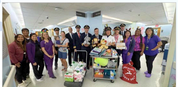
United Airlines' 'Pilots for Kids' Makes a Generous Donation to our Pediatric Department