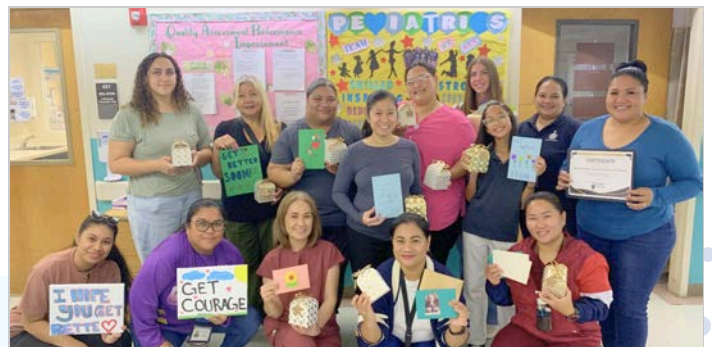
Sanctuary Spreads Joy with Gift and Card Donations to our Pediatric Patients