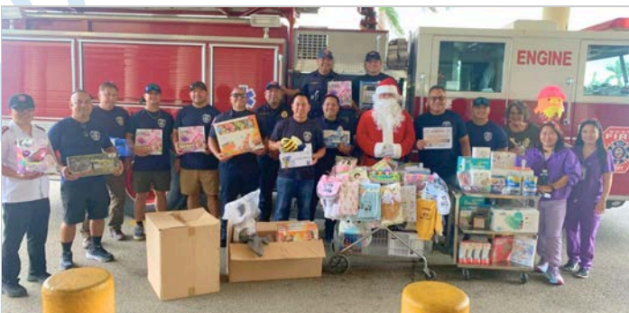
Guam Fire Department, Salvation Army, and Santa Deliver Gifts to GMHA Pediatric Patients