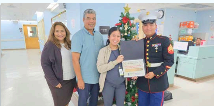
GMHA Pediatric Unit is Grateful to the Armed Forces Committee, Camp Blaz, and Toys for Tots